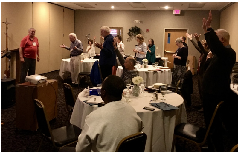
Participants at the ADL Convocation.

We also asked how the Association of Diocesan Liaisons (ADL) will relate to the NSoC. The steering committee will explore the possibility of combining our annual convocation with the February NSoC gathering. The thought was that liaisons would participate in the gathering as representatives of their dioceses, and then meet separately afterwards (see