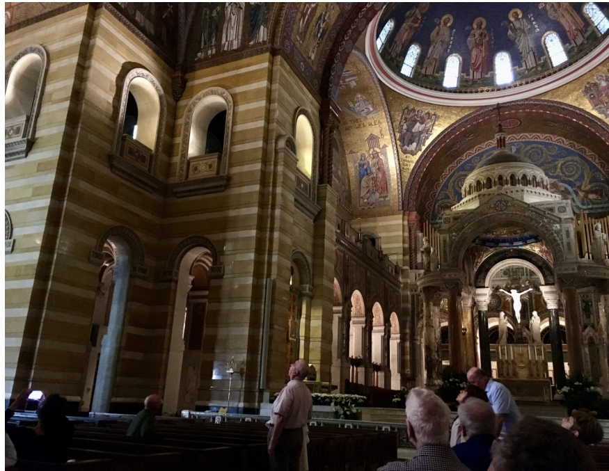
Photograph of the interior of the Cathedral Basilica of St. Louis, St. Louis, MO.

The main item at our annual business meeting on Thursday was simplifying the bylaws. The changes gave the Steering Committee greater flexibil-